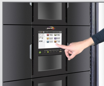
Convenient front panel color touchscreen

Easy to use and manage, the library's management software provides a similar feature set as the rest of the Spectra tape library family, including an intuitive color touchscreen, remote web interface, ability to create partitions (up to 20), built-in diagnostics, media lifecycle management, encryption, and encryption key management. An optional SpectraVision web camera can be mounted on top of the library to provide a visual assessment of all robotics and interior components.