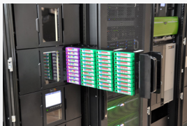
Loading 40 tapes at a time

Your data is critical to your business, but it can be expensive to store all your data. Tape is known for its affordability and Spectra Stack utilizes LTO tape media, a high-capacity tape storage technology designed for dependability and cost effectiveness. It's a powerful, scalable and adaptable tape format that addresses the exponential data growth and storage challenges organizations face today – at the most affordable cost per GB in the industry. For as low as 1 cent per gigabyte, Spectra Stack delivers an extremely reasonable data storage option.