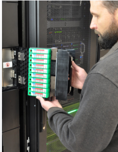
Loading ten tapes at a time