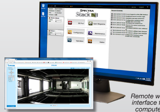
Remote web interface for computer